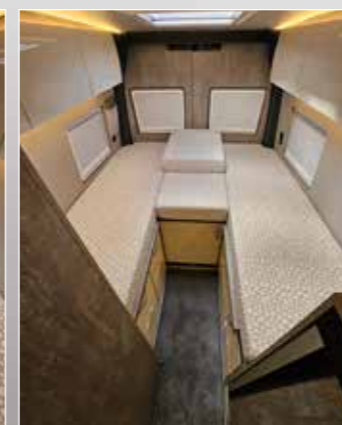
Altair Daytime Layout